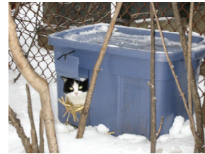
Masquerade in shelter

Our senior volunteers work very hard to build shelters for the feral cats of feral cat caregivers. Not only do we support the TNR projects of feral cat caregivers but offer them an opportunity to keep our seniors busy by purchasing at cost, a feral cat shelter made from Rubbermaid Roughneck containers, insulation and straw. The cost of the materials this year is $40 and each senior that builds the shelter gets a photo of the cat(s) that use it. It keeps them motivated to do something for the cats even when they